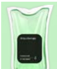
SKINNY & BEAUTY