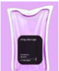
ANXIETY & CALM