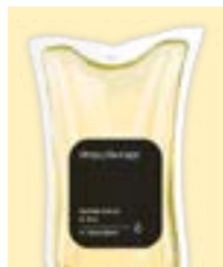
SUPER COLD & FLU