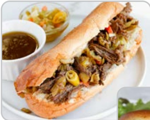
Italian Beef and Chicken Parmesan